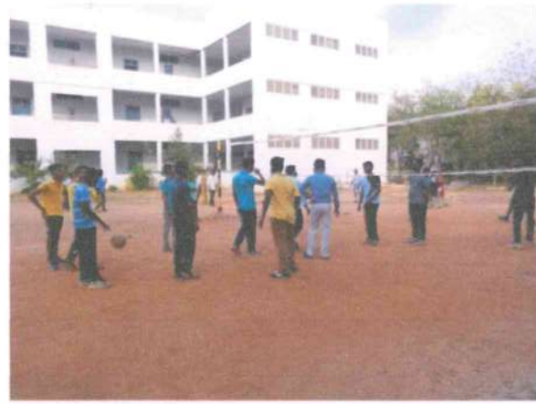
Volley Ball Field