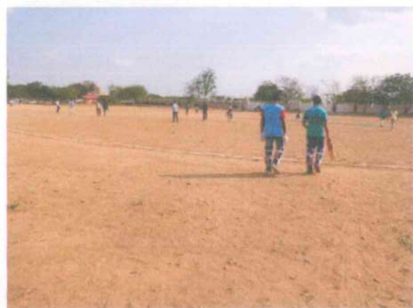
Tennis Ball Court