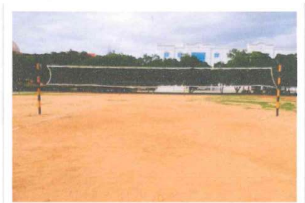
Basket Ball Court Ball Badminton Court